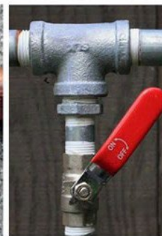
Galvanized Steel & valve